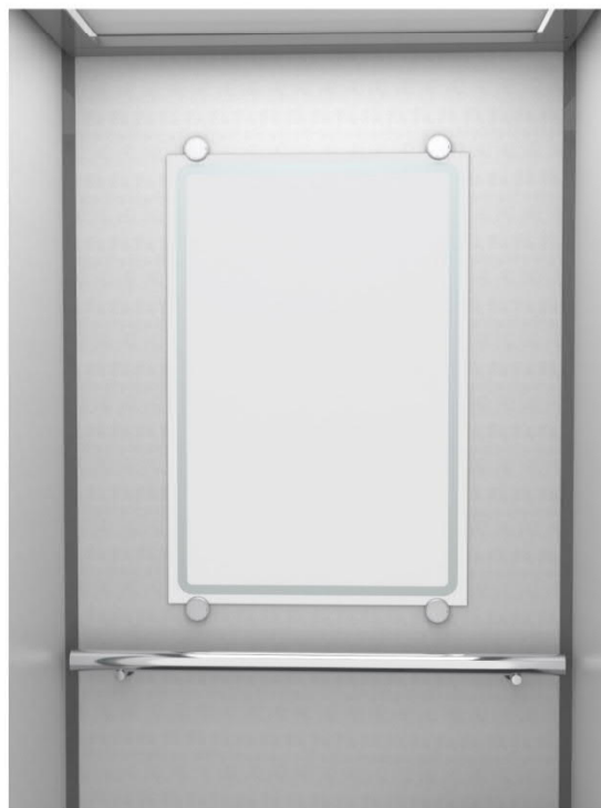
Jméno: LC Classic - zrcadlo PPS25