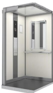
Jméno: LC Classic_PPS3_Altro Black (1)