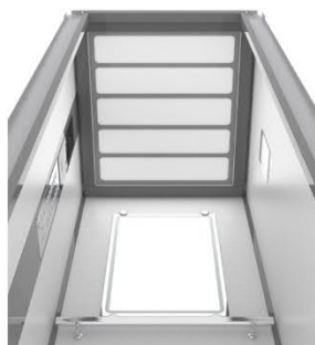
Jméno: LC Classic - podhled 2_PPS25