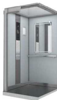
Jméno: LC Classic_PPS12_Altro Black (1)