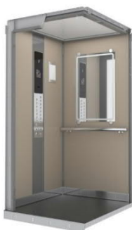
Jméno: LC Classic_DT67_Altro Black (1)