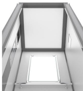
Jméno: LC Classic - podhled 0_PPS25