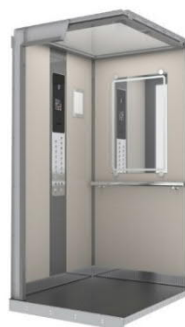
Jméno: LC Classic_N1_Altro Black (1)