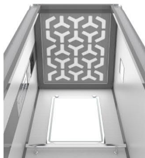
Jméno: LC Classic - podhled 6_PPS25