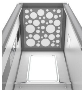
Jméno: LC Classic - podhled 4_PPS25