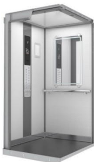
Jméno: LC Classic_PPS25_Altro Black (1)