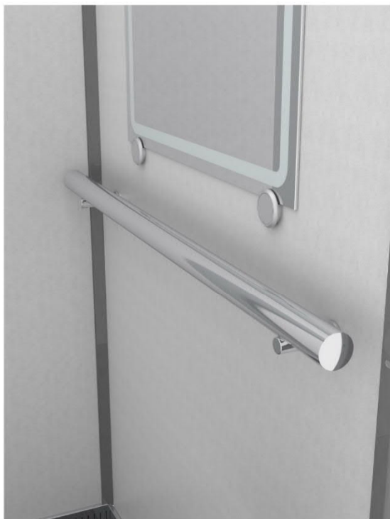
Jméno: LC Classic - madlo_PPS25