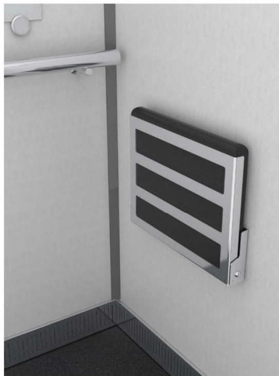
Jméno: LC Classic - sedátko 1_PPS25