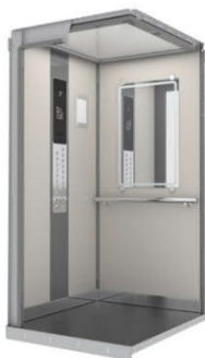
Jméno: LC Classic_DT63_Altro Black (1)