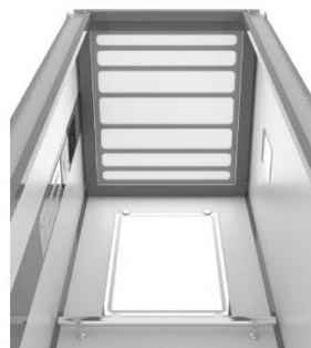
Jméno: LC Classic - podhled 1_PPS25