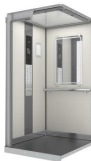
Jméno: LC Classic_DT66_Altro Black (1)