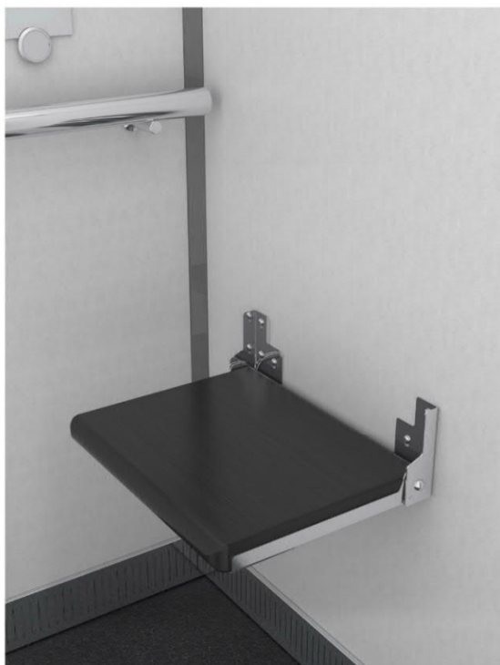
Jméno: LC Classic - sedátko 2_PPS25